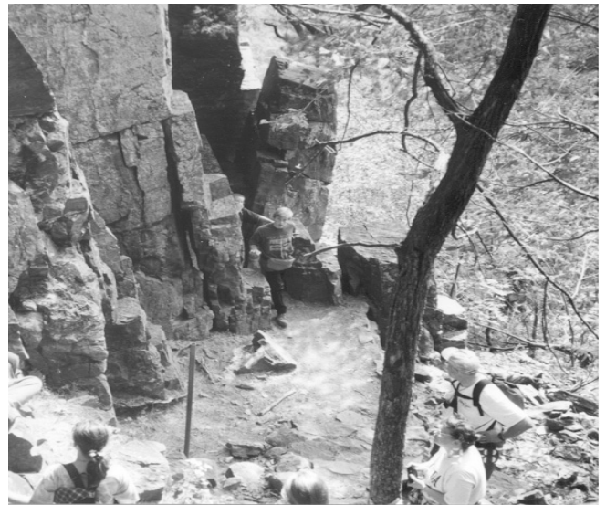
Hiking near Devil's Doorway

As always, volunteers are necessary to ensure a smooth running and safe event. Help is always needed for check points. If you would like to volunteer to help make our events a success, please contact Badger Trails, Inc. through the Internet at: www.badgertrails.org or email at: info@badgertrails.org .